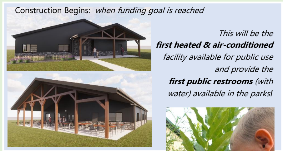
Construction Begins: when funding goal is reached

The current park levy is an operational levy (not a capital levy) put in place to maintain and manage the park system. It generates around $650,000 a year. Currently, there are 11 parks with one more addition expected later this year, donated by the Black Swamp Conservancy.